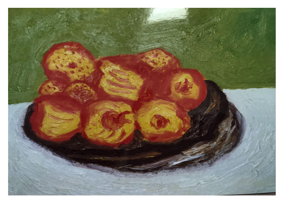
Organic fruit from the market

Any Evolutionary Kosmic Engagement being created is valuable. Just drinking coffee with a friend can be very valuable in these terms. Or being friendly and respectful to your fellow human beings meeting at the marketplace, buying e.g. some organic fruit. Or contributing to a better life and future for a child. Or an animal, or taking care of your garden.