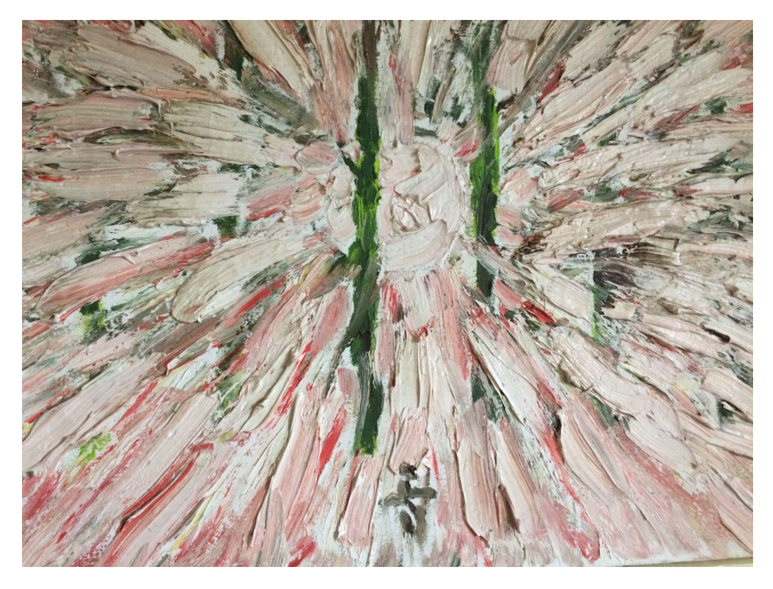
Flash of non dazzling bright white light visible at the Causal state, see figure 1

There are five states of consciousness. Gross, Subtle, Causal and the one and only state that is present in and underlying all states: Turiya, the Witness, Pure Consciousness, Eye of Spirit.