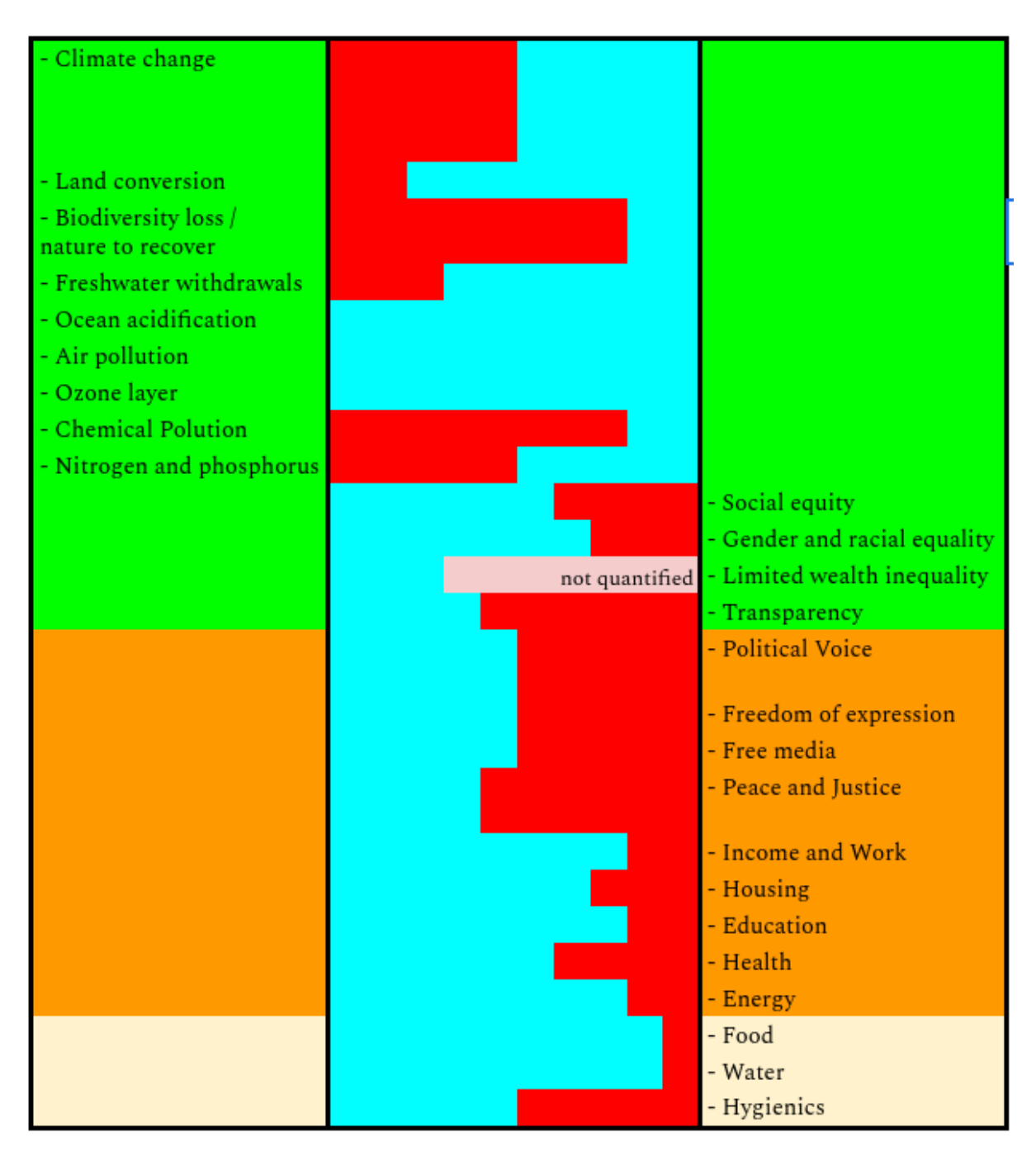
Figure 6: Limits on a sustainable and just space for humanity (See Notes)